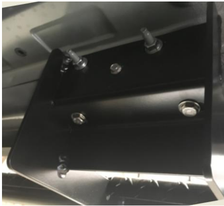
Figure 1: Hardware Installed Through Nerf Bar Brackets

PRO TIP: It may be helpful to use a wire brush to remove some of the factory under-coating on the studs and threaded inserts. First check studs/inserts with a nut/bolt to determine if it's necessary.