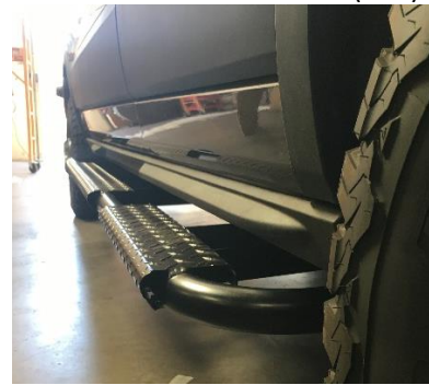
Figure 2: Alignment of Nerf Bar to Body Side