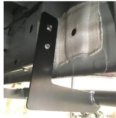
Figure 3: Rear Blade Secured into Position