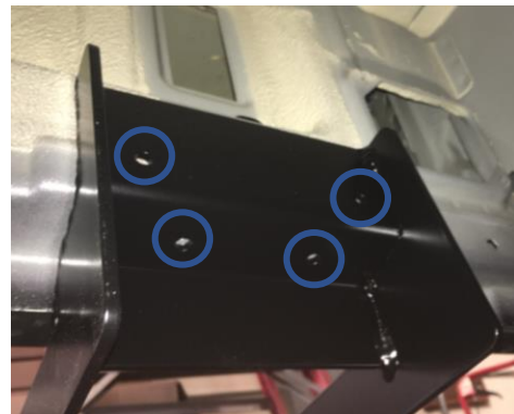
Figure 4: Driver's Side Middle Bracket