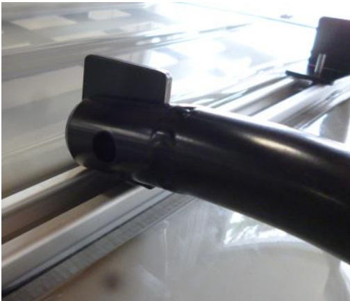
Figure 2: Ladder Positioned on "L" Brackets