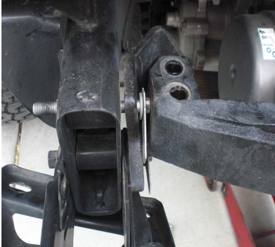
Figure 2: Vehicle front view with bumper removed