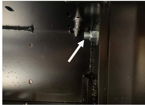
Figure 7: 1/2" hex bolt inside the toolbox