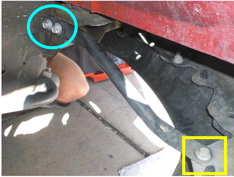
Figure 1: Stock bumper tension rod