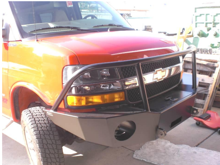
Figure 8: Installed bumper