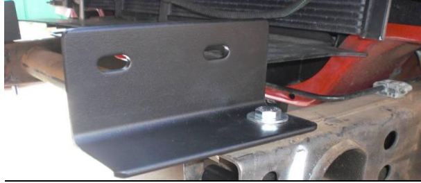
Figure 4: Installed bumper bracket