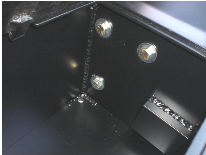
Figure 5: View of toolbox inside, showing correct orientation of mounting hardware