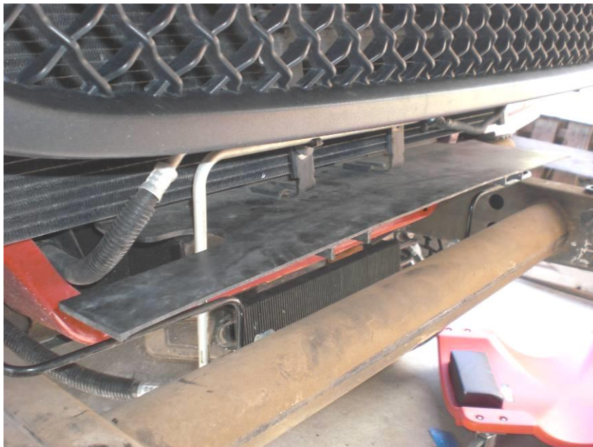
Figure 3: Trimmed plastic shield