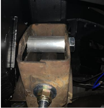
Figure 6: 1/2" hex bolt with crush tube