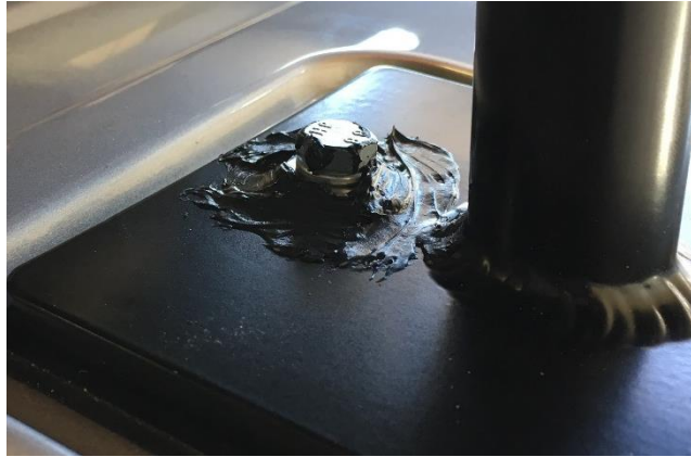
Figure 5: Final Silicone Seal

15. Your roof rack is now installed. Check all fasteners for fitment after 50 miles of driving, and periodically thereafter. Enjoy!