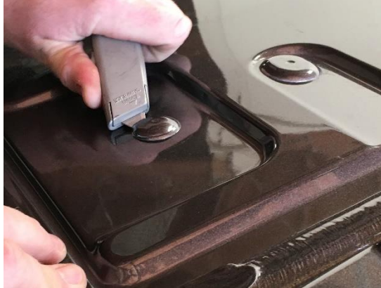
Figure 1: Factory Plug