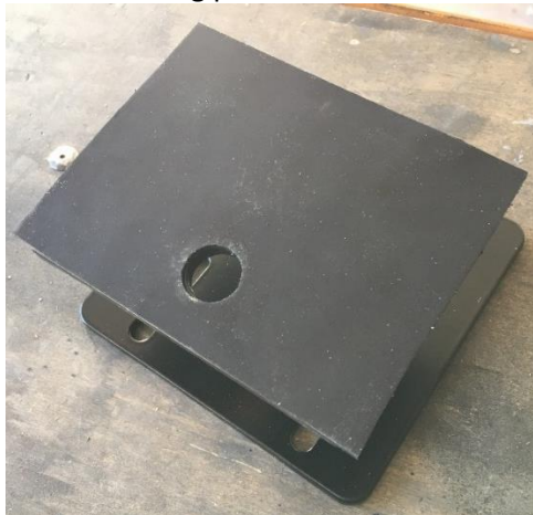
Figure 2: Rubber Pad