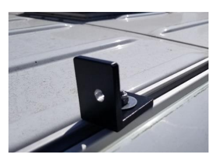
Figure 1: "L" Brackets Installed on Factory/Aftermarket Tracks