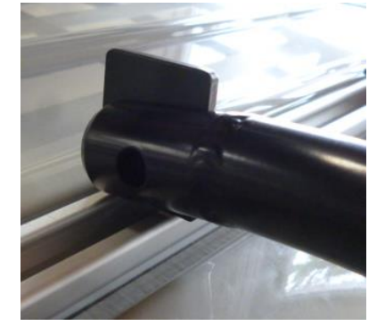
Figure 2: Surf Pole Positioned on "L" Brackets

Install the 5/16" bolts, washers, and nuts and tighten by hand—do not torque down bolts yet.