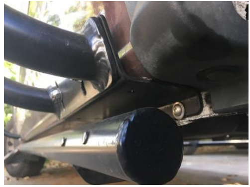
Figure 3: Lower Bracket Installation