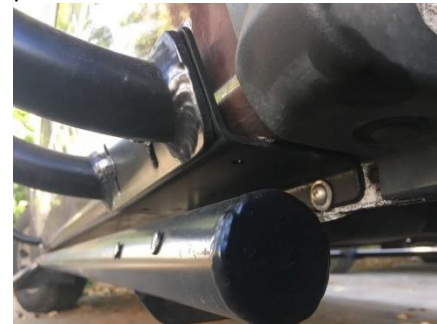
Figure 3: Lower Attachment Installation