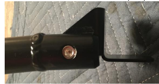
Figure 2: Ladder Attachment to Upper Brackets