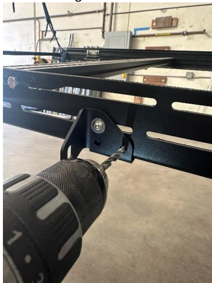
Figure 1: Upper Attachment Brackets