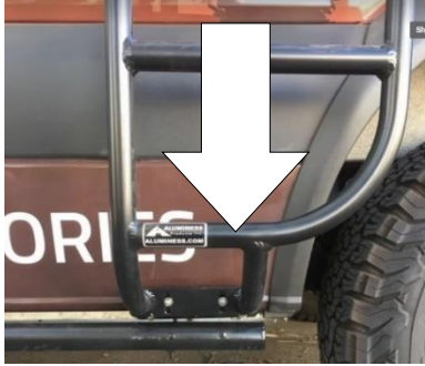
Figure 4: Lower Attachment Assembly

ladder in place. NOTE: BE CAREFUL to not over tighten be sure to apply anti-seize.