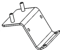
PN 301008: Lower Attachment Bracket – 1X