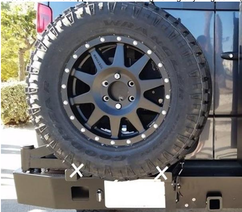
Figure 1. Rest tire on both support arms (before tightening the lugs or ubolts down). *NOTE* Your bumper may look different than the one seen in the above picture.