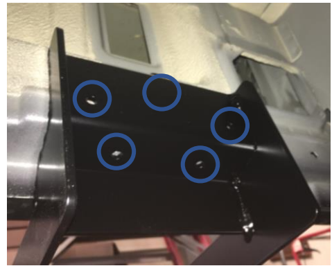
Figure 6: Driver's Side Middle Bracket

NOTE: There are pre-cut holes to attach the middle bracket on the driver's side. Four (4) screws may be used on this bracket only.