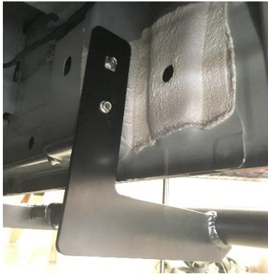
Figure 5: Rear Blade Secured into Position