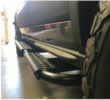
Figure 4: Alignment of Nerf Bar to Body Side