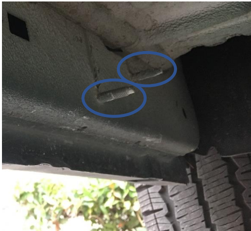
Figure 1: Example of Factory Studs