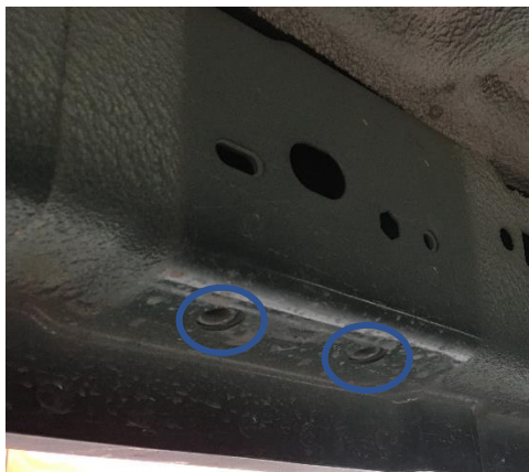
Figure 2: Example of Factory Threads