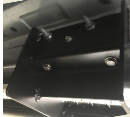
Figure 3: Hardware Installed Through Nerf Bar Brackets