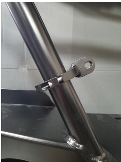
Figure 1. Pipe clamps bolted to brush guard.