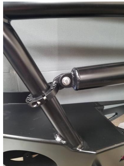
Figure 2. Crossbar bolted to pipe clamp tabs.