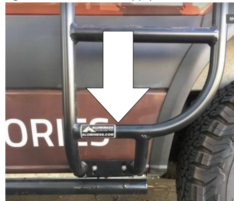
Figure 4: Lower Bracket Tightening Technique.