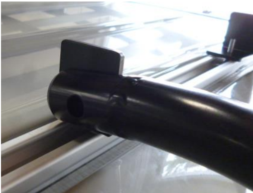
Figure 2: Ladder Positioned on "L" Brackets