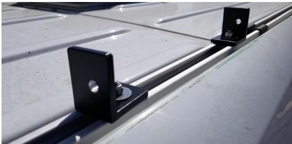
Figure 1: "L" Brackets Installed on Factory/Aftermarket Tracks