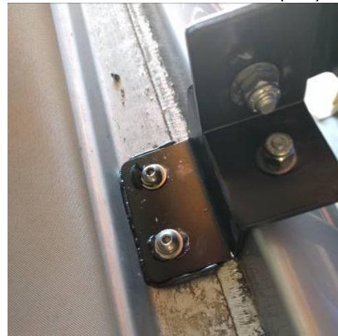
Figure 2: Upper Attachment Assembly Installed into the Roof Gutter