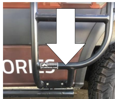
Figure 4: Lower Attachment Assembly