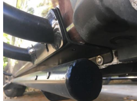
Figure 3: Lower Attachment Installation