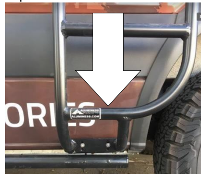
Figure 4: Lower Attachment Assembly